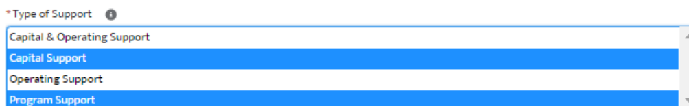
FIGURE 1: MULTI-SELECT PICKLIST IN FLOW

Type of Support is multiselect data type and multiple values can be selected. In order to select multiple values, press and hold CTRL (Windows) or CMD (Mac) and select values.